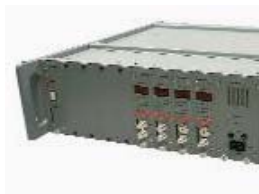
3Ru integrate CATV system